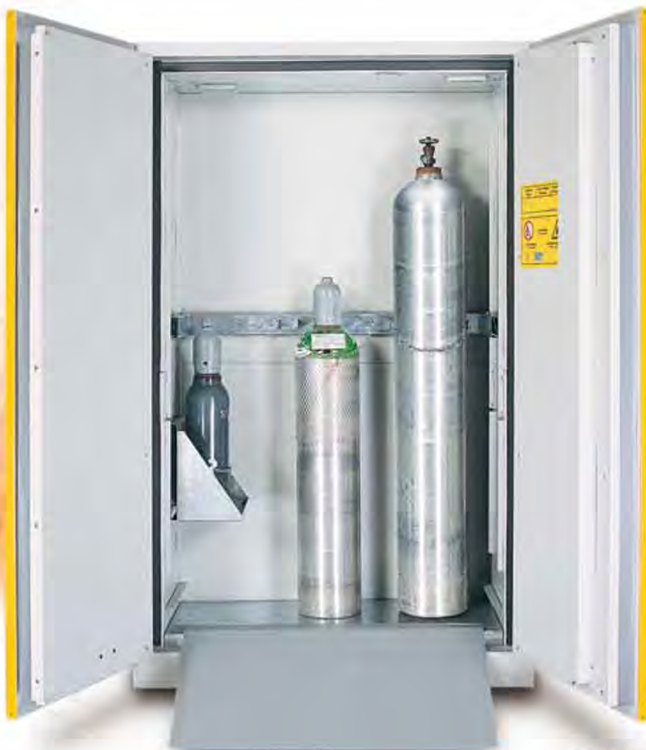
B 120 G 30