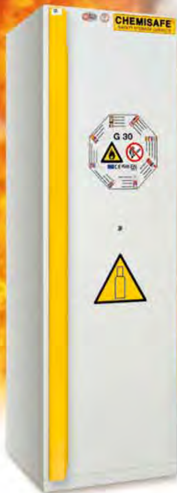
B 60 G 30