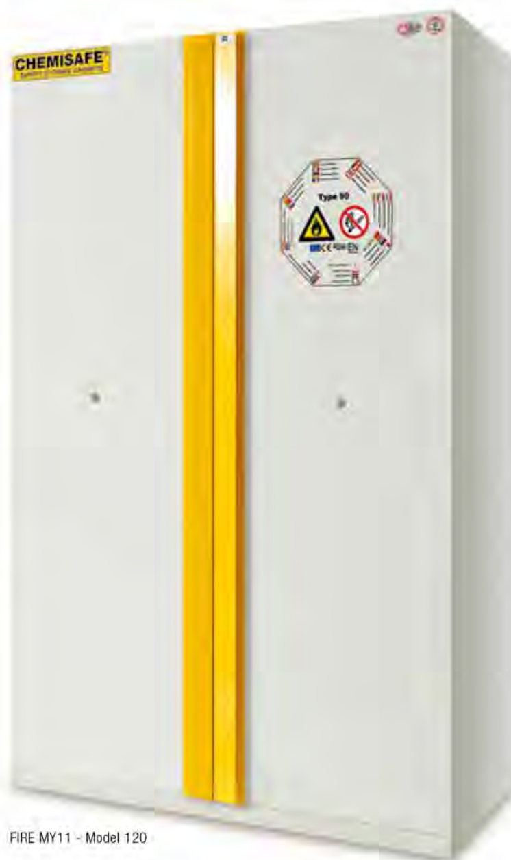
FIRE MY11 - Model 120