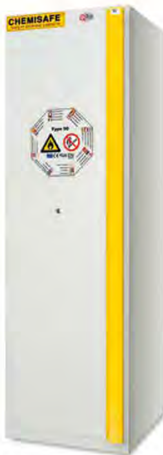
FIRE MY11 - Model 60